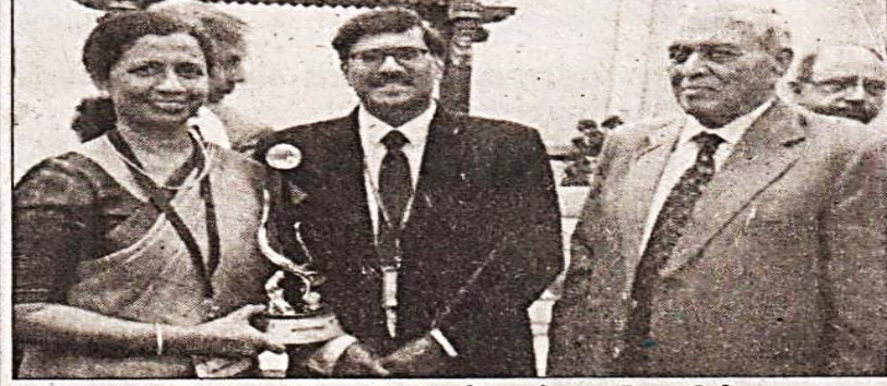
சிறந்த பொறியியல் கல்லூரிகளில்